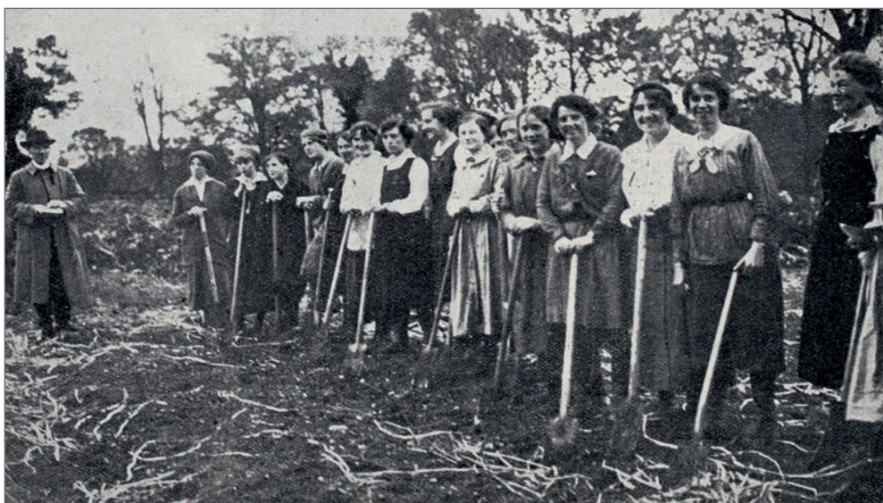
Figure 2B. Arbor Day at Meanee, from Irish Life , November 10 th 1916.