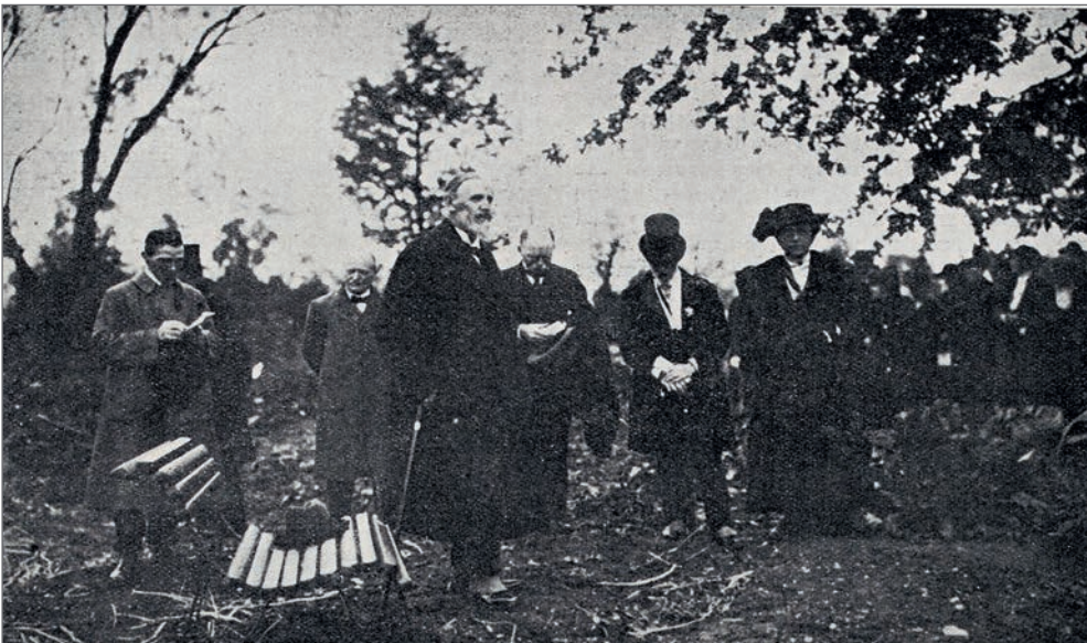
Figure 2A. Arbor Day at Meanee, from Irish Life , November 10 th 1916.