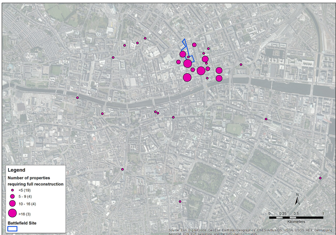
Figure 2: ‘Battlefield site’ contextualised with the areas of most significant military action (represented by buildings requiring full reconstruction after the Rising)

has raised apprehension not just for those concerned about its wider implications for planning law, but also for broader understandings of the impact of the 1916 Rising and other pre-1916 historic battles within the city. The designation is also questionable given the evidence of the spatiality of the 1916 Rising. Figure 2 compares the distribution of buildings requiring full reconstruction after the Rising (a proxy for the area which saw the most intense artillery fire by the British army as it quelled the Rising), with the court-designated 1916 Battlefield Site. There are clear discrepancies between the arena in which the most significant action took place and that which has been legally designated. While numbers 14-17 Moore Street are ‘authentic’, in that they have survived in their current form since 1916, there has been limited discussion of the extent to which most of the designated battlefield site has survived or subsequently been rebuilt.